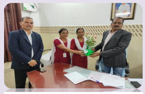
CHIEF DISTRICT MEDICAL OFFICER