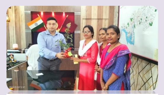
SUPERINTENDENT OF POLICE