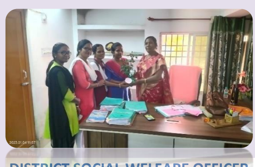
DISTRICT SOCIAL WELFARE OFFICER